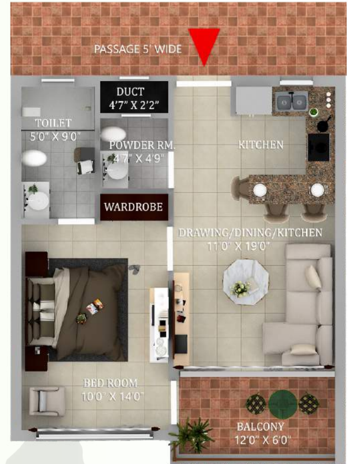
ONE BHK PLAN