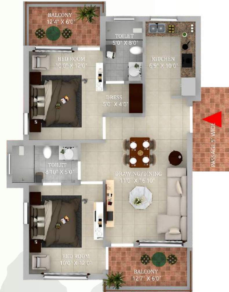
TWO BHK PLAN